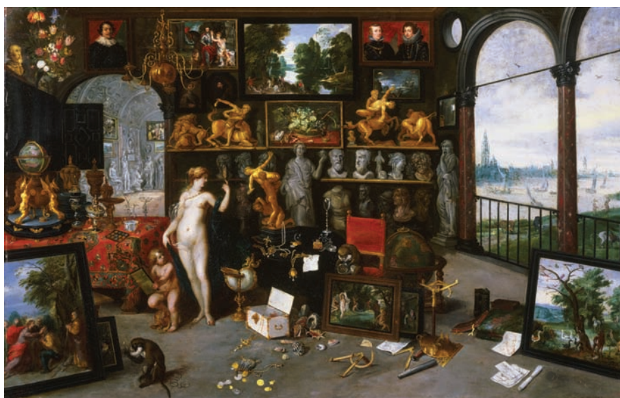
Jan Bruegel the Younger, Venus and Cupid in the Collector's Cabinet , c. 1660, oil on copper, 22 7 / 8 x 35 5 / 16 ".

he emphasized aesthetic value in his own printmaking; he experimented with various techniques and papers for maximum effect to produce the finest impressions, differentiating among various states. He also acquired other artists' prints, not only for aesthetic delectation but also as teaching tools for his pupils. Other artists employed prints as aids to